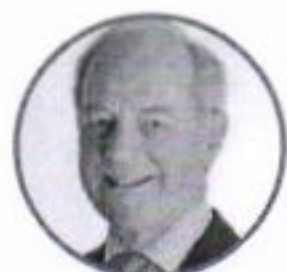
Lord Peter Lilley Member of the House of Lords, United Kingdom