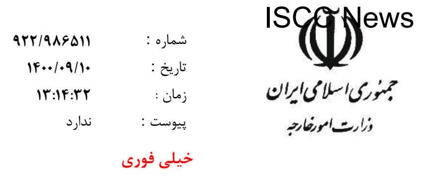
به نام خدا

جناب آقای فرحناکیان مشاور محترم وزیر و سرپرست مرکز امور بین الملل و هماهنگی دیپلماسی آب و برق -وزارت نیرو